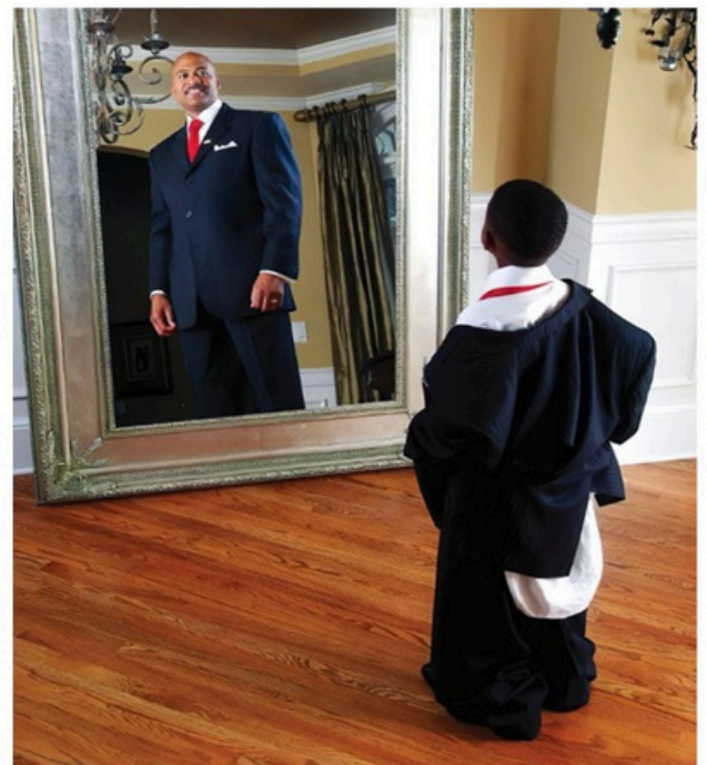
What They See Is What They'll Be